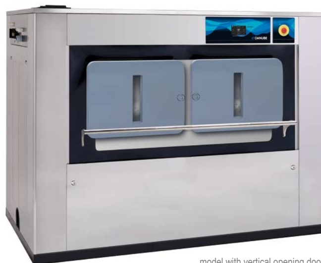
model with vertical opening door